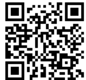
Monarch CareFinder™ is currently available for iPhone® and Android™ devices

You can always locate physicians, hospitals, laboratories, radiology centers and 24-hour pharmacies on our website. Visit our website for maps and other important information.